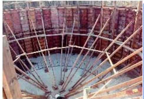
Concrete Shell Forms