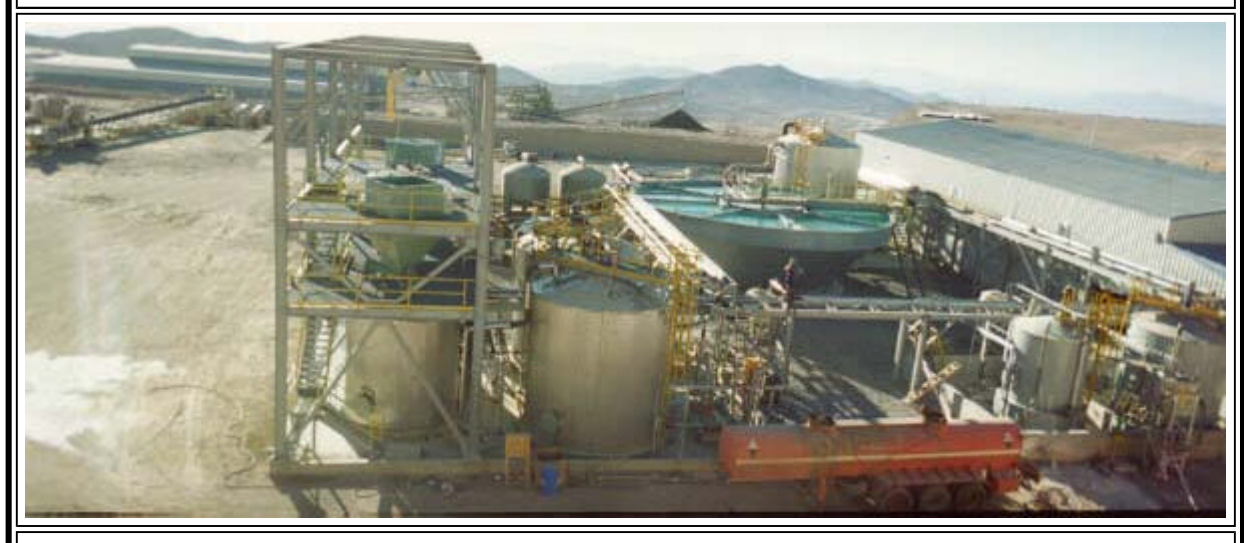
Copper Mining in the Andes - Zaldivar, Chile

Operation since 1995, High Purity Water for Electrowinning Reactor Precipitation, Filtration, Dual Stage Reverse Osmosis